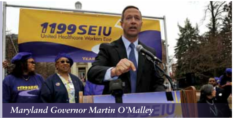
Maryland Governor Martin O'Malley