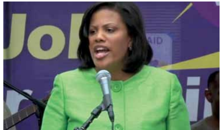
Mayor Stephanie Rawlings-Blake supports 1199