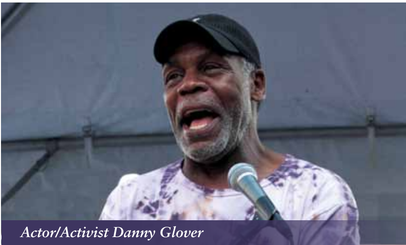
Actor/Activist Danny Glover